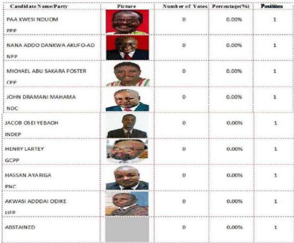
Fig 5.0 Results Sheet

party, the passport photograph of the candidate, the total votes for each candidate, and the percentage of votes per candidate as well as the positions of each candidate.