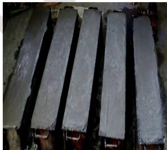
Fig 4: Beam specimens after casting

For evaluating the flexural strength, a concrete beam was subjected to flexure using symmetrical third point loading until failure occurs according to the ASTM C 78-02. The modulus of rupture is determined from the moment at failure. Flexural strength of the beam specimen is calculated according to IS516-1959.