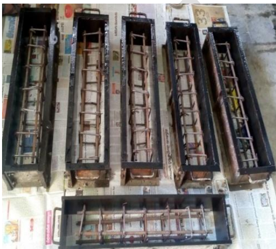
Fig 3: Steel mould with reinforcement

A total of 18 specimens were cast in steel moulds of size 150x150x700mm. Among these, 6 specimens were cast without reinforcement as PCC specimens. Another 6 specimens were cast with steel reinforcement and rest of the specimens with bamboo reinforcement. Fig 3 and 4 are representing steel moulds and casting of specimens after manual vibration.