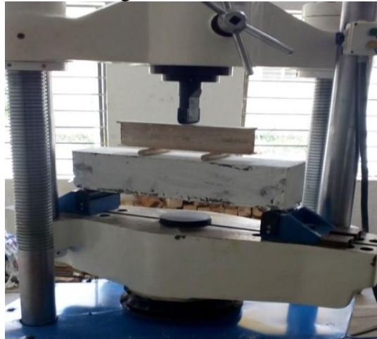
Fig 5 Third point loading arrangement

stresses, so that the critical crack developed at any section in one-third of the beam length. The probability of a weak element (of any specified strength) being subjected to the critical stress is considerably greater under third-point loading than when a central load acts, the centre-point loading test will give a higher value of modulus of rupture and more variable values. In consequence of this, centre-point loading test is very rarely used in resolving the flexural strength. Test set up of third point loading specimen is represented in Fig 5.