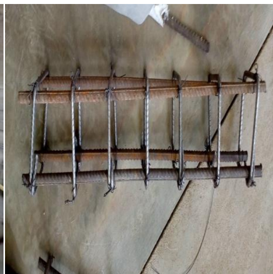
Fig 2: Steel Reinforcement