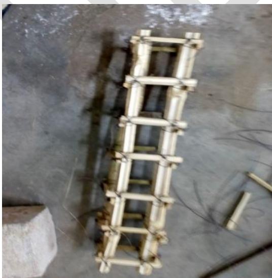
Fig 1: Bamboo reinforcement