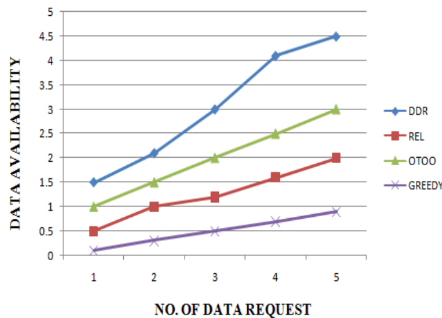
Figure 3 : Data Availability Vs No. of Data Request