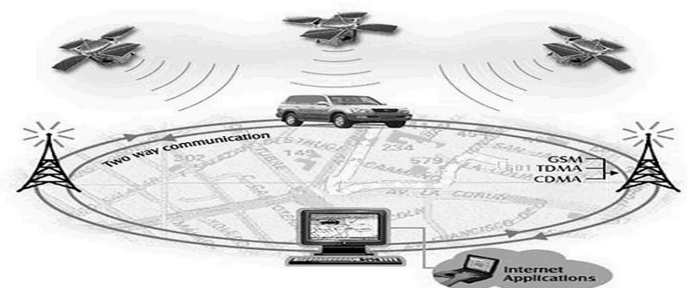
Figure 1. Vehicle communication system

The working principle behind GPS is the dimension of space (or "range") between the satellites and the receiver. The satellites tell us precisely where they are in their orbits by broad casting data the receiver uses to work out their positions. It works something like this: If we know our exact space from a satellite in space, we know we are wherever on the surface of a pretend orb with a radius equal to the distance to the satellite radius.